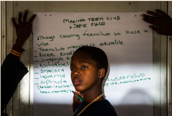
Teen clubs across the BIPAI network allow youths to develop leadership skills, promote healthy living habits and help teens transition into adulthood.