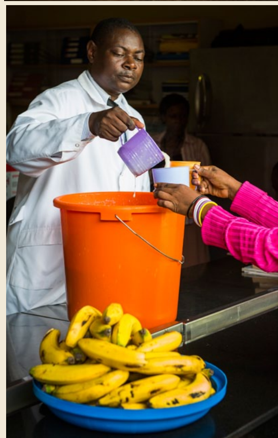
Supplemental nutrition supports patients living in resource-limited settings.