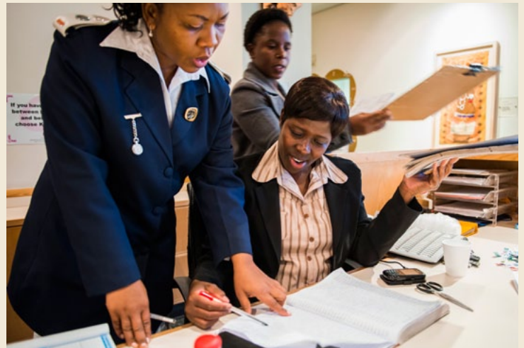
BIPAI's dedicated employees extend across 13 countries.