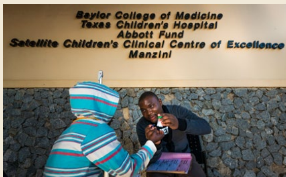
Sputum induction training helps health workers accurately test for tuberculosis.

*Patients in care at BIPAI clinics and outreach sites.