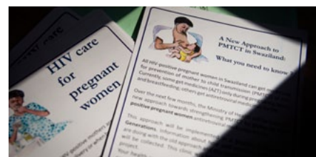
Communications are targeted to populations with the goal of reducing mother-to-child transmission.