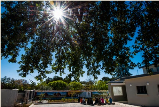
In 2014, BIPAI Botswana opened the first adolescent-only center for HIV-positive teens in Africa.