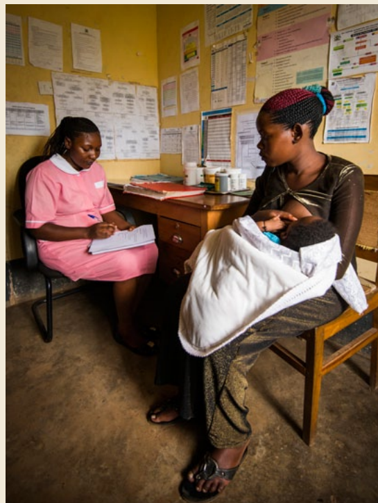
Antenatal visits help ensure the health of HIV-exposed infants and their mothers.

Public education takes many forms throughout the BIPAI network, responding to the unique needs of each country where it operates. Regardless of location, the campaigns work to reduce stigma, encourage early testing, safe sexual practices and access to care and treatment.